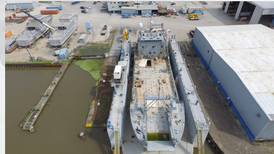
Service Life Extension Program | Comprehensive SLEP to the U.S. Navy Landing Craft